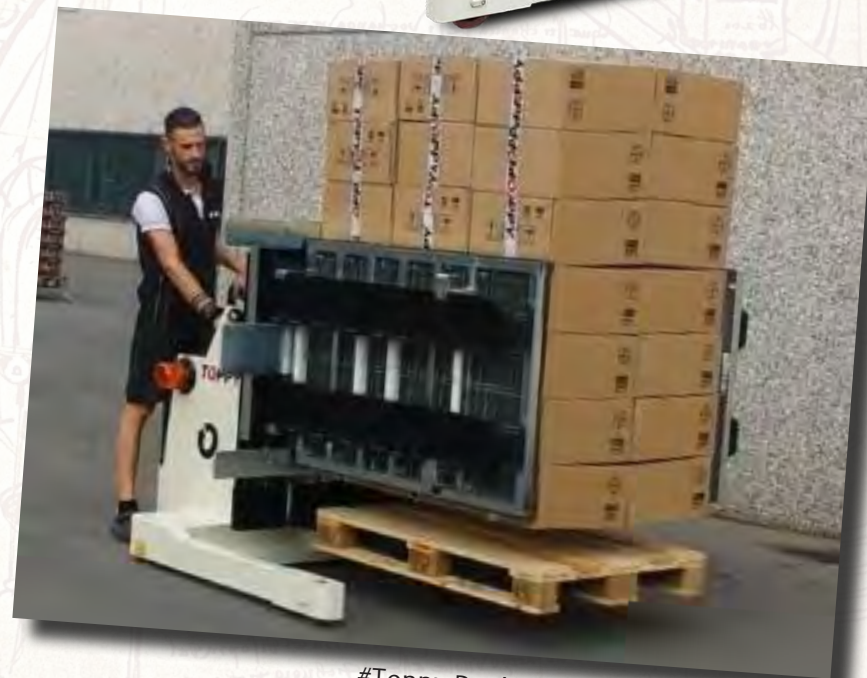
#Topy Dual press - Side press mode